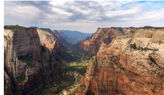
Zion National Park (Utah)