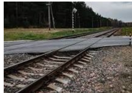
Recessed train track