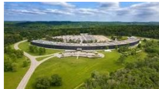
Eero Saarinen TJ Watson Research Ctr