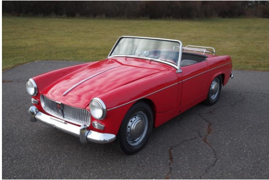
Need a car

Palo Alto (later Silicon Valley) to Regina, Saskatchewan, quickly